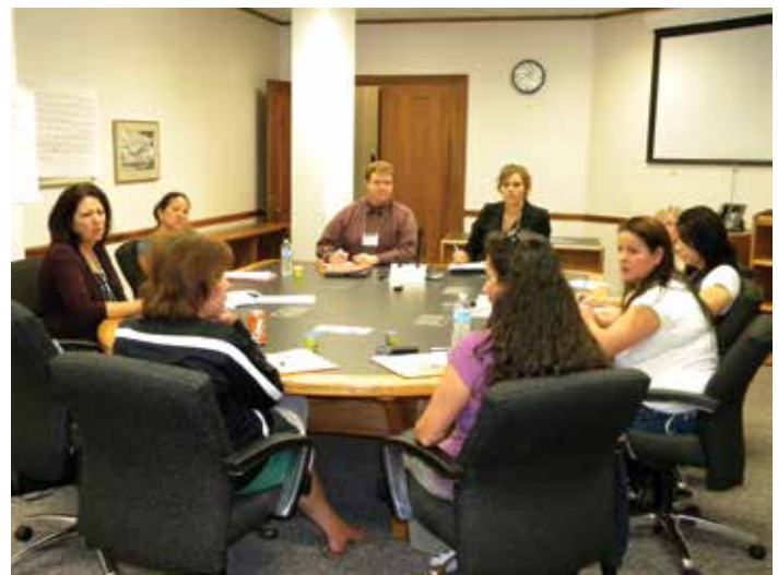
Participants at the Dakota Oral Care Workshop participate in a break-out discussion.

The next step for the group includes visits to each community to see how help can be provided in the areas of prevention, education and access.